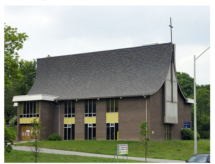
8142 Islington Avenue