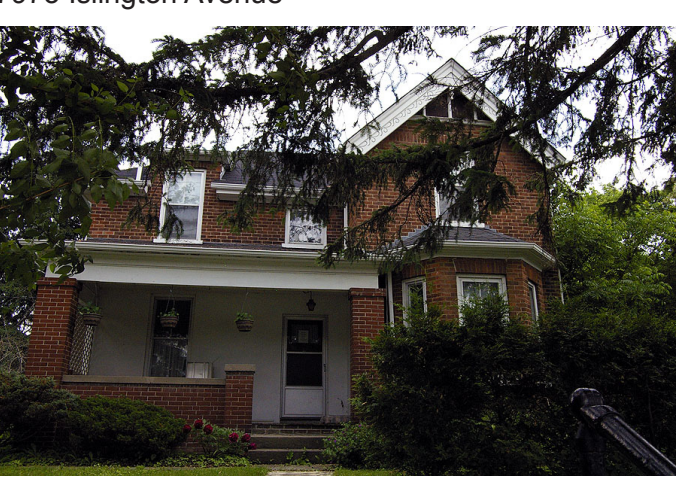
8025 Islington Avenue