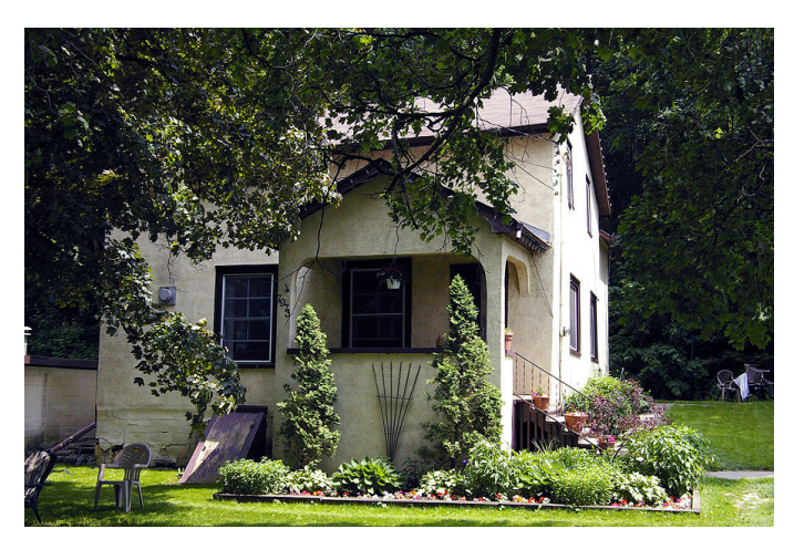
7973 Islington Avenue